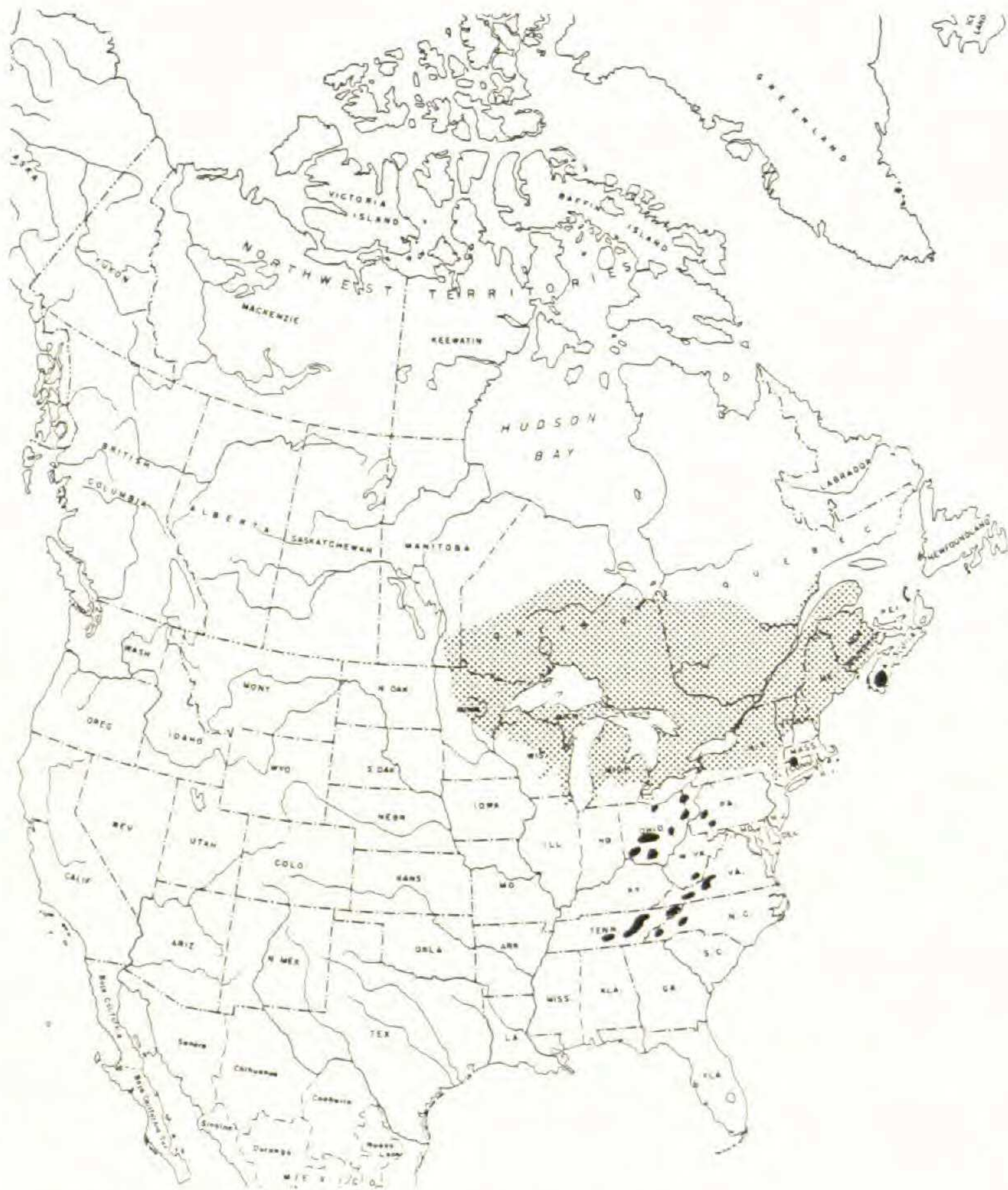
Figure 3. Alleghanian element: distribution of Thuja occidentalis (after Little, 1971).

invaded. An alternative explanation might be that many of these Alleghanian species could more easily colonize poor, poorly developed and bare soil than could typical Eastern Deciduous Forest species. In addition, the Eastern Deciduous Forest species, with their refugia in the south-central United States, were able to migrate rapidly northward into the unglaciated soil of the northern midwest (Davis, 1983). It may have then presented a closed community to the Alleghanian species spreading out from Appalachian refugia.